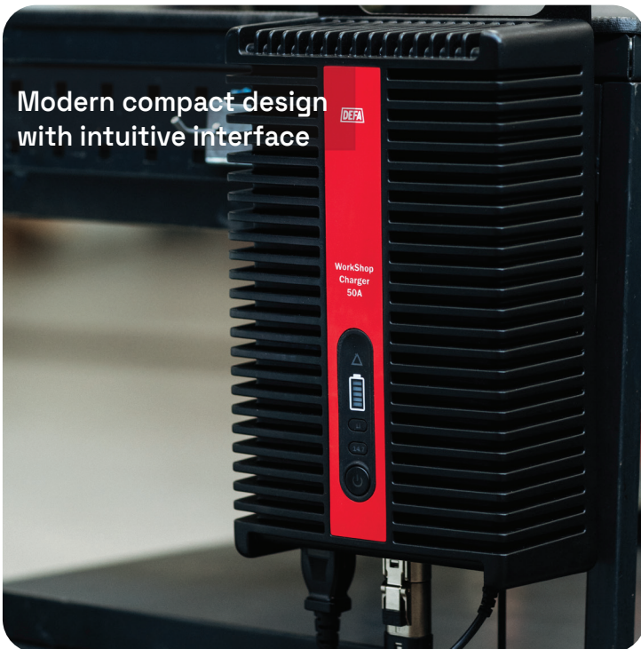
Modern compact design with intuitive interface