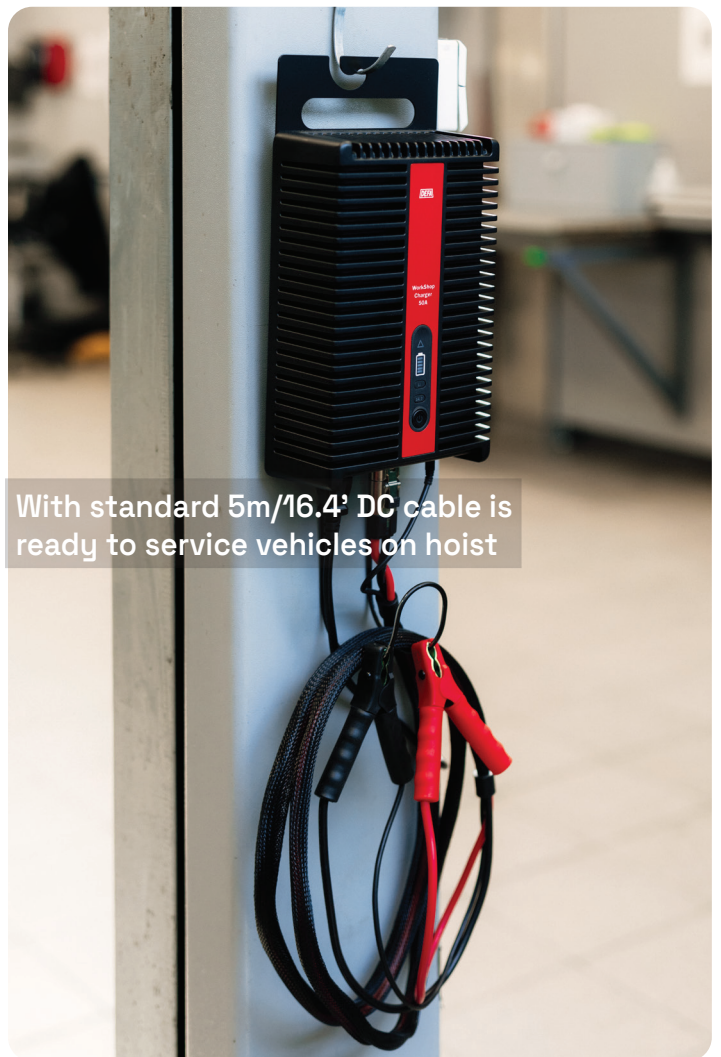
With standard 5m/16.4' DC cable is ready to service vehicles on hoist